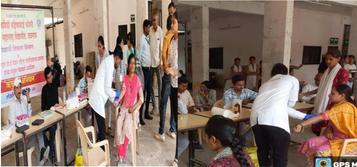
Civil Hospital Staff checking Hb of students during “Haemoglobin Checking Campaign”.