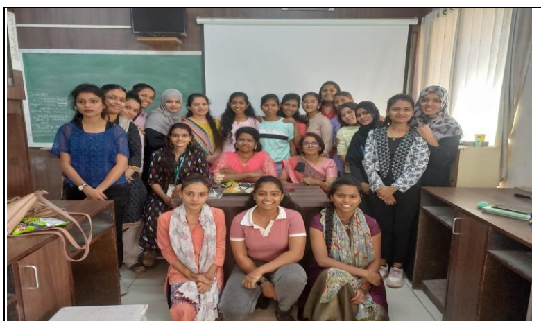
Zoology Alumni Meet organized on Valentine Day of 2023.