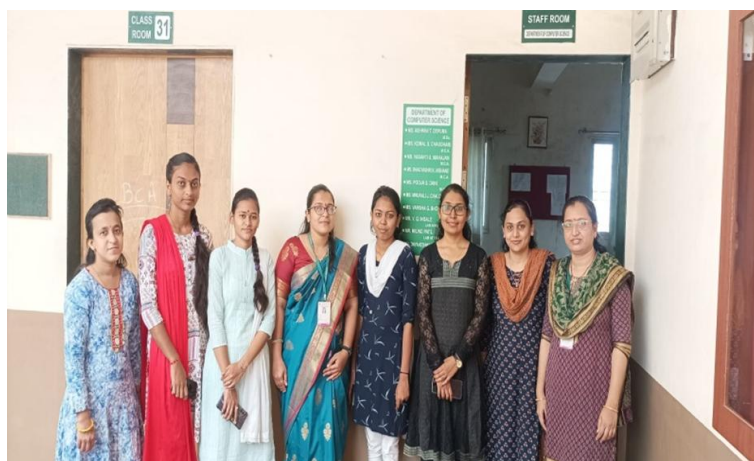
Alumni from Computer Department present for Computer Alumni-Meet-2023-24