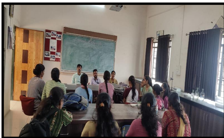
Discussion among staff and students during Alumni meet organized by Department of Chemistry