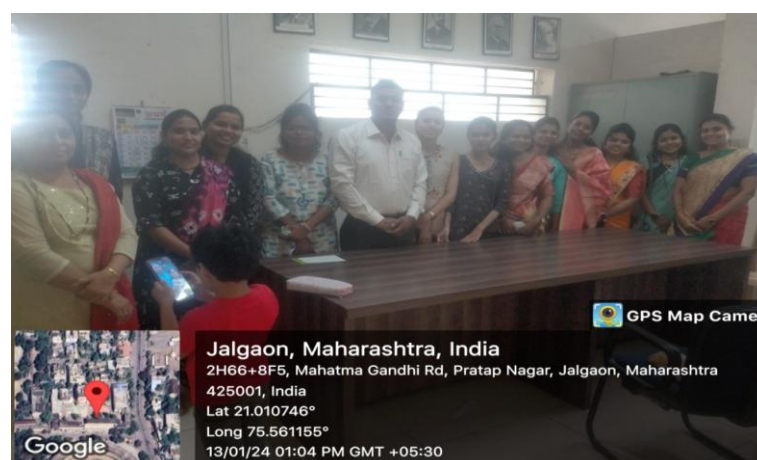
Alumni gathered in Alumni-meet organized by Department of Psychology